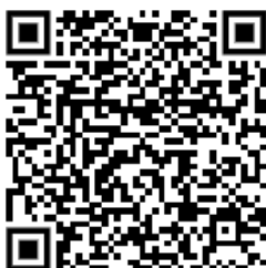
Grimley Parish Council Minutes of previous meetings webpage

Parish Council Website: http://e-services.worcestershire.gov.uk/MyParish